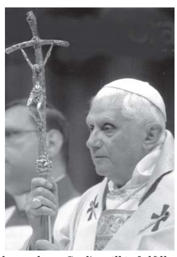
place where God's will is fulfilled, the core of what he says is again connected with his mission. The unity of his will with the Father's will is the core of his very being. □

Now when Jesus speaks to us of God's will and of heaven, the