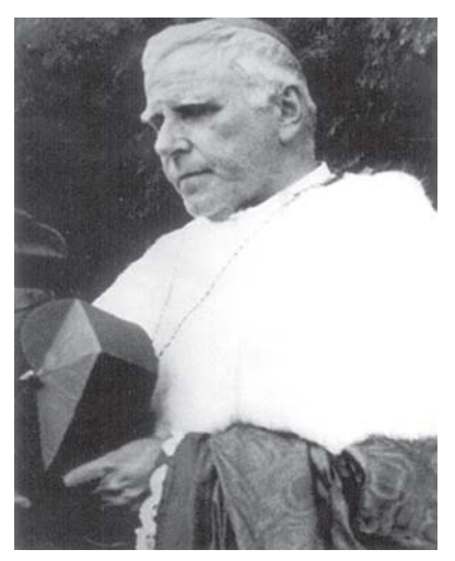
Card. Josef Mindzenty

Finally on March 12<sup>th</sup> 1959, community found a permanent residence in three rooms: the innermost room was turned into a chapel with the Blessed Sacrament exposed. It was like