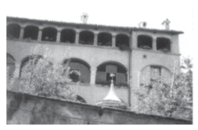
The hostel and monastery at Pinerolo, today

date solennelle! (31st July, a memorable and solemn day). Those words already reflect the fame and holiness that accompanied Don Bosco. Unfortunately we are unable to translate the entire document for this article, but some fleeting remarks should suffice.