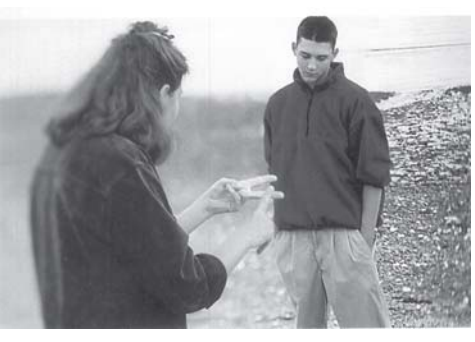
Forgiveness restores everyone, those who are offended and those who offend

In fact, it is important to note that the Lord graciously forgives the sinner whoever he is, when he accepts to be converted, but should a sinner refuse to repent he expresses the wish not to be reunited to Heaven! Heaven is the house of love and the one who does not want to love God (and therefore his neighbour) does not wish to live in a world of love!