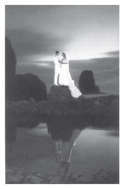
Couple love reflects on earth God's fidelity to man

to God. He is triune, because Father and Son are like the two poles of the divine relationship and the Holy Spirit is the link in this relationship, the personified love between the Father and the Son.