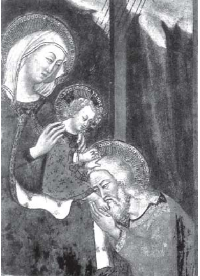
'Here in this picture of contemplation is the core of our life, the encounter with Christ.'

You don't have to be a monk or a religious sister to do this. Nor do you have to be in the twelfth century! I like this recent story about an Australian mother who went on retreat. She listened to the talks of the retreat director, and tried to follow his advice about