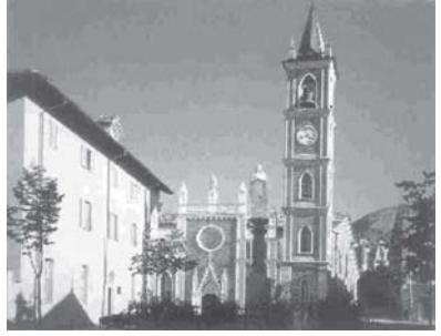
The Salesian House, Lanzo

A typical case of "reaching out" to the civic authorities was at the inauguration of the Turin-Lanzo