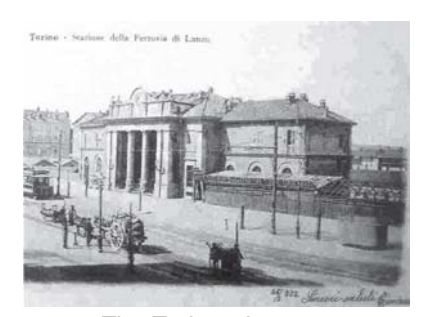
The Turin to Lanzo Railway Station

"Then you are a bigger sinner than I," Nicoterà replied "because you know what is wrong and do