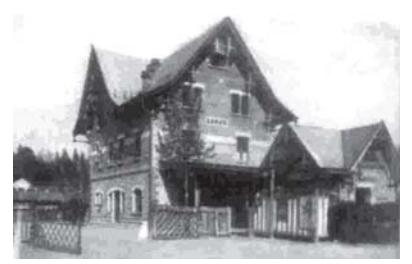
The Old Railway Station - Lanzo

Vermouth was served and the ministers came through the porch and into the garden accompanied by Don Bosco who started a light and cordial conversation with them. Nicoterà, then jokingly opened fire on reports that Don Bosco was very close to the Pope but Don Bosco was not outwitted. He declared his loyalty to the Pope and his respect for the government authorities too. The conversation grew more animated