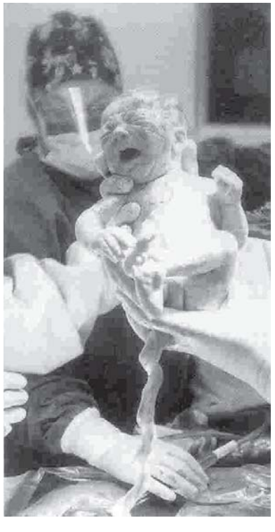
Every baby is a gift of God