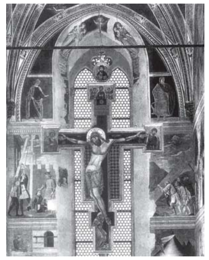
The Chapel of St. Francis of Assisi in Arezzo

To abstain from TV: fix a day in the week when you won't switch it on just so that you may rediscover the joys of reading a good book or be able to have a heart-to-heart talk with your own child, teenage or spouse rather than looking at the TV screen all the time. You will rediscover the liberating feeling of a 'text-free' existence which allows you to discover that it is actually not necessary. These 'disciplines' are