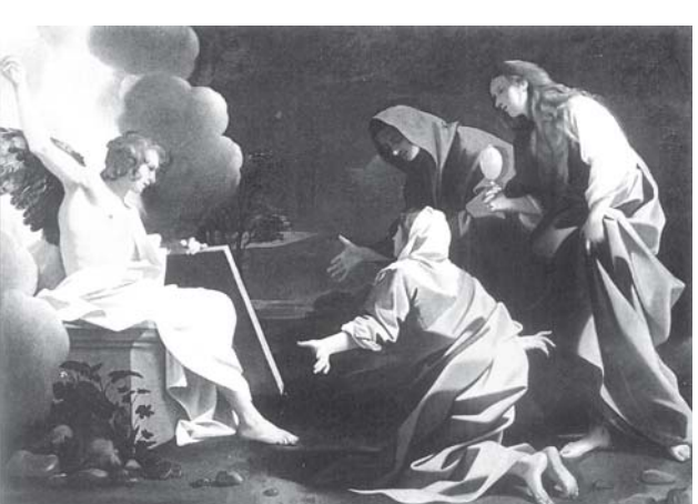
The Marys at the Sepulchre by Bartolomeo Schedoni, Parma, Italy

We can therefore quite understand that were stunned when they found the sepulchre open and empty. Luke says they W е r "perplexed" which meant, they literally did not know where to go and what to do.