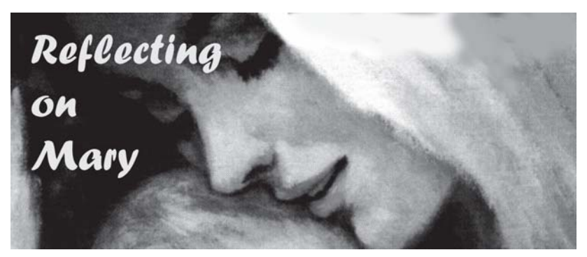
8th April, 2013 - The Annunciation of the Lord