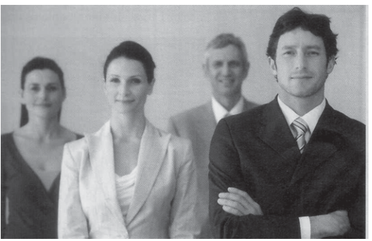
"There's an ocean between saying and doing," says a proverb and youngsters don't want adults to say "nice things." They want concrete gestures

In May of 2010, this indecent age was incarnated by "Indignados 15 de Mayo" in Madrid and it spread through half of the piazzas of Europe demonstrating that they were inspired by other indecent