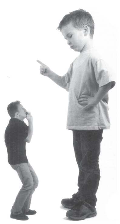
Children and teenagers are keen observers of reality and often express with naive sincerity the hypocrisy of adults