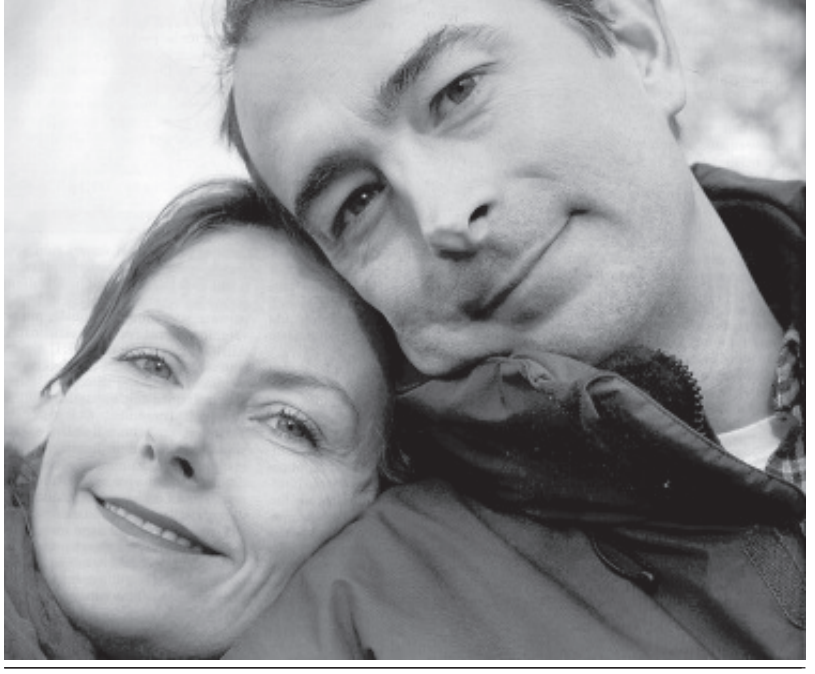
April 2020 5 Don Bosco's Madonna

Violence and domination is another risk; signs of real evil in the couple's union. It begins with claims that one has become deaf